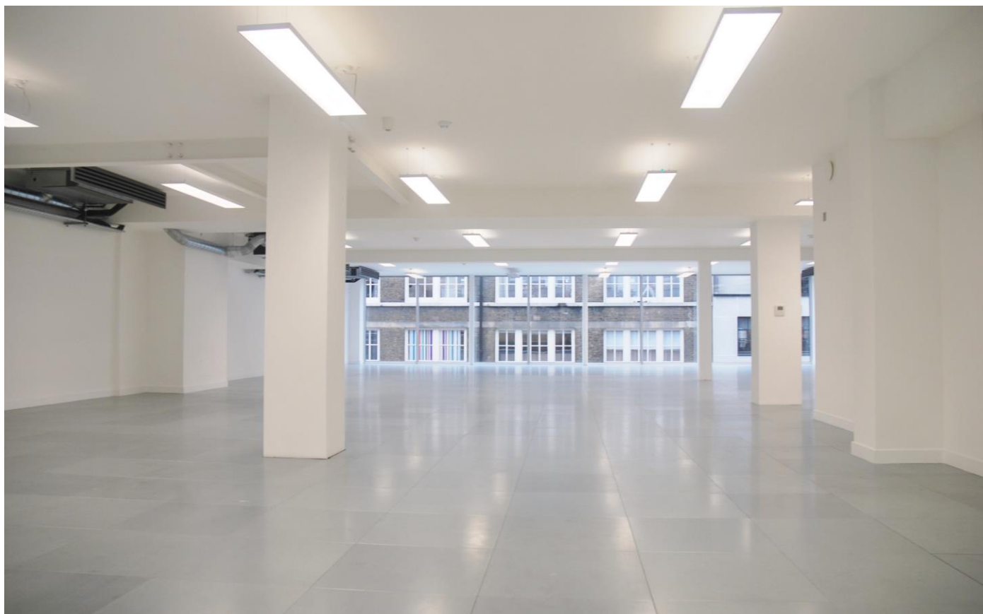
Photo of space before fit out